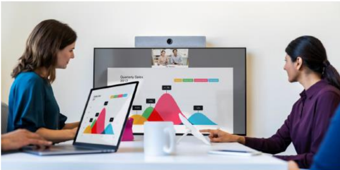
Figure 1. Cisco Webex Room Kit Mini in a Small Room

The Room Kit Mini is ideal for huddle spaces with three to five people because of its wide 120-degree field of view, which allows everyone in a huddle space to be seen. It also offers the flexibility to connect to laptop-based video conferencing software via USB. The Mini is tightly integrated with the industry-leading Cisco ® Webex platform for continuous workflow, and can register on premises or to Cisco Webex in the cloud.