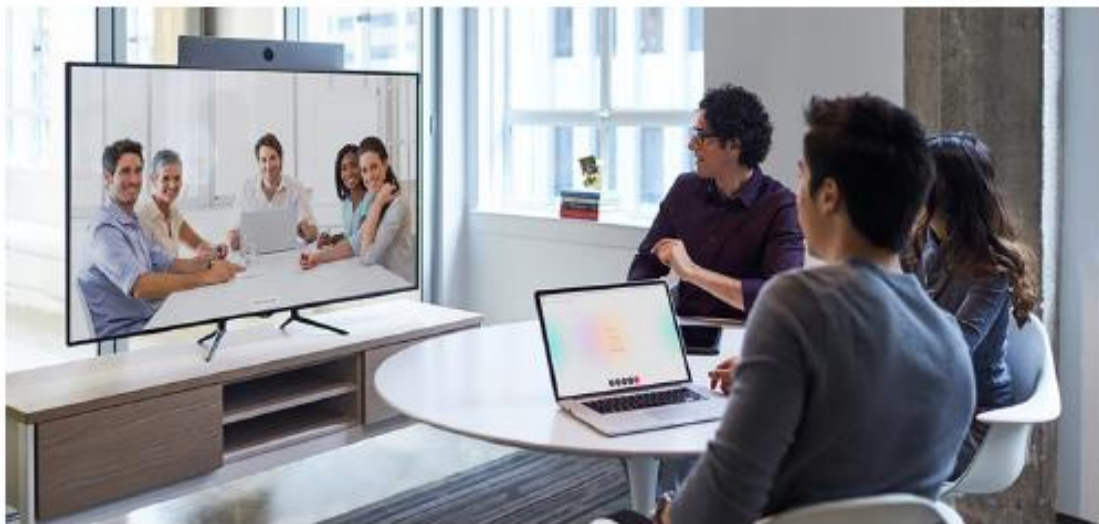
Figure 1. Cisco Webex Room Kit in small room scenario

The Room Kit – which includes camera, codec, speakers, and microphones integrated in a single device – is ideal for rooms that seat up to seven people. It offers sophisticated camera technologies that bring speaker-tracking capabilities to smaller rooms. The product is rich in functionality and experience but is priced and designed to be easily scalable to all of your small conference rooms and spaces – whether registered on the premises or to Cisco Webex.